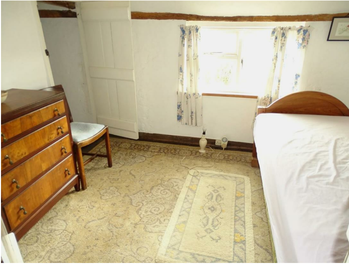
Ceiling beam, built in cupboard, window with farmland views.