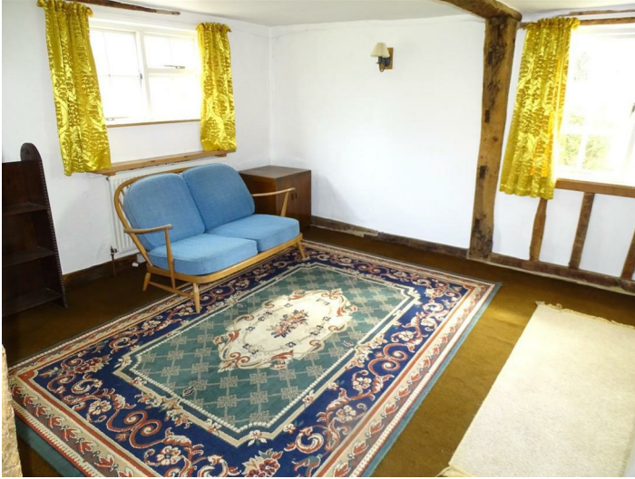
SITTING ROOM 15 x 11'5 (4.57m x 3.48m)

Feature brick fireplace, exposed beams, studwork, three windows with farmland views, two radiators, door to stairs to first floor.