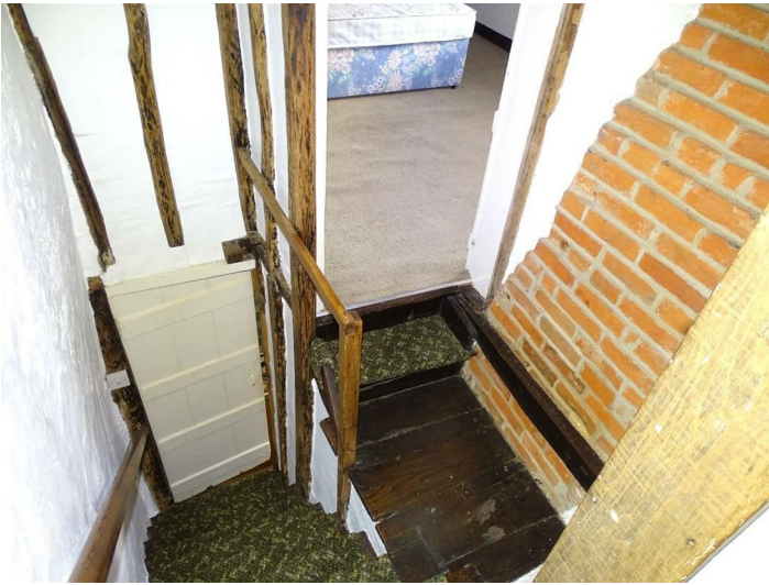
STAIRS TO GROUND FLOOR