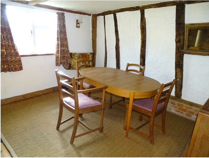
DINING ROOM 12'10 x 11'5 (3.91m x 3.48m)

Feature brick fireplace, alcove, window with farmland views, exposed beams, open floorboards, borrowed light window to kitchen/breakfast room.