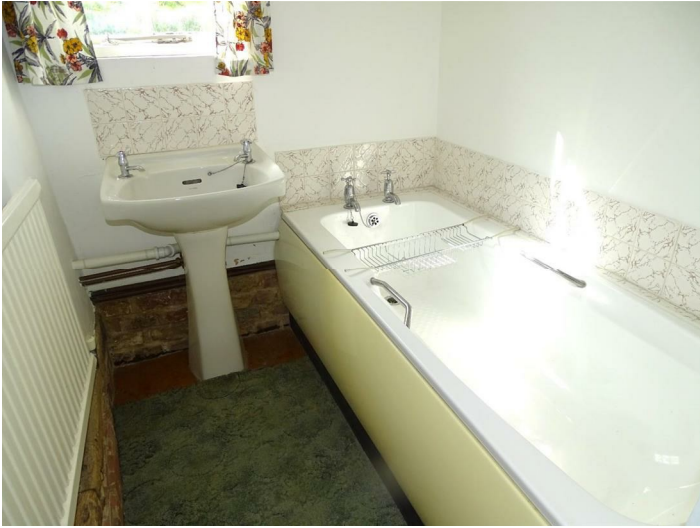
Panelled bath, pedestal wash hand basin, radiator, window.