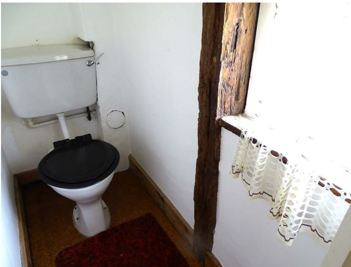
Low level wc, frosted window.