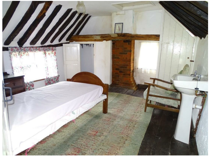
BEDROOM TWO 12'10 x 11'10 (3.91m x 3.61m)