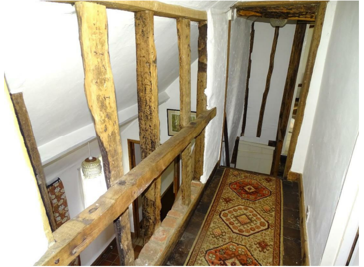
Studwork allows views to the hallway below, feature brick breast, access to roof space.